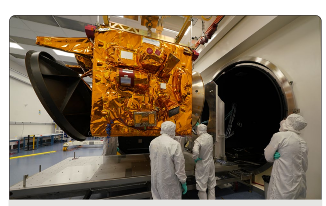
EMM engineers prepare the Hope Probe for environmental testing in LASP's new thermal vacuum chamber.

EMM was the second mission to make use of LASP's new class 10,000 high-bay cleanroom and recently updated vacuum chamber, which allowed program engineers to conduct on-site thermal, shock, and acoustic testing for this SUV-